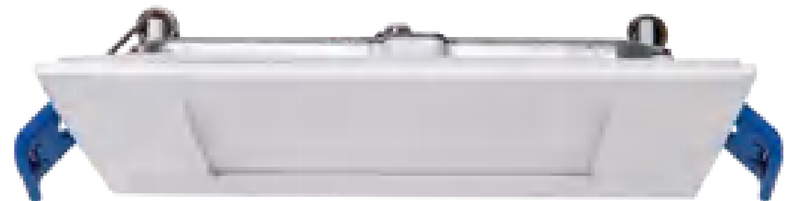
available in square