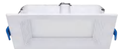
available in square