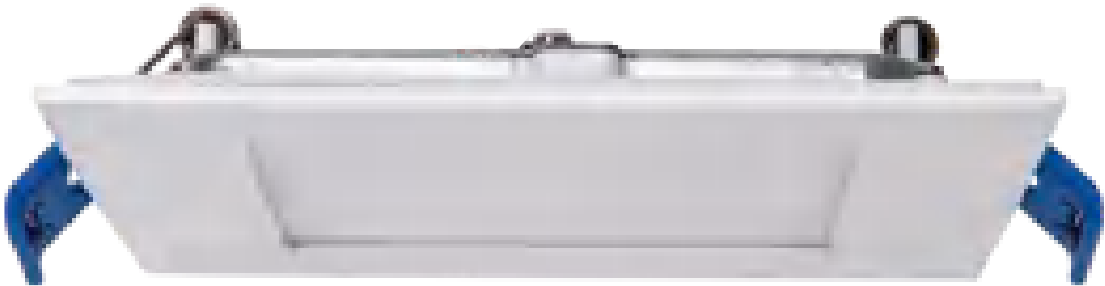
available in square