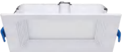
available in square