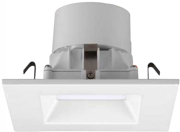
available in square